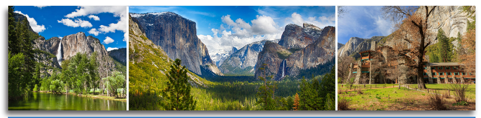
Good Times Travel Yosemite Spring Fling

Featuring a Two-Night Stay at Tenaya Lodge at Yosemite , Yosemite National Park, Sugar Pine Railroad , Basque Meal April 28-30, 2024 – 3 Day Tour