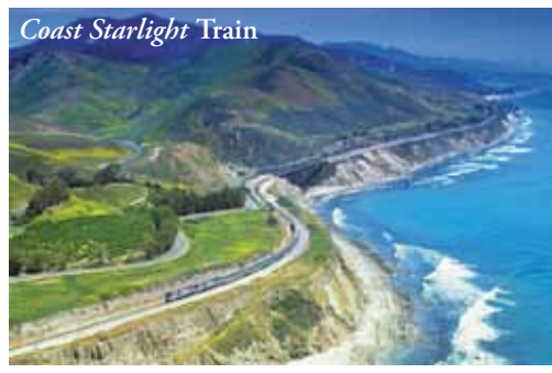
Coast Starlight Train