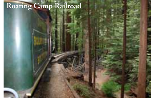
Roaring Camp Railroad