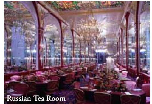
Russian Tea Room

Letterman . Visit Central Park and Strawberry Fields – the tribute to the late John Lennon by his wife Yoko Ono. See the Lincoln Center , Carnegie Hall , the Plaza Hotel , Columbia University , the Cathedral of St. John the Divine , Harlem , the Metropolitan Museum of Art , the Guggenheim Museum , the Frick Museum and the celebrity estates along Central Park East and West, and drive through Harlem . This afternoon is free for you take in the city at leisure. Perhaps a horse-drawn carriage ride around Central Park? This evening, a farewell dinner at a local favorite. Following dinner, join your Tour Director for an optional excursion to the Top of the Rock observation deck atop 30 Rock to see the beauty of New York City at night. (Dinner)