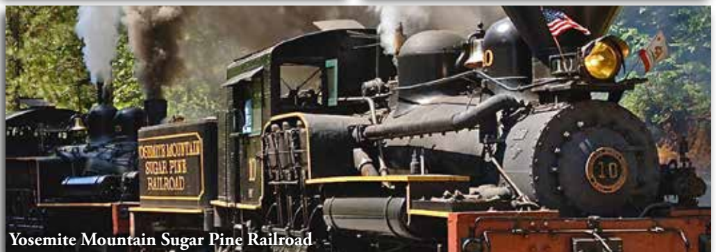
Yosemite Mountain Sugar Pine Railroad

Double Occupancy: $749 per person Single Occupancy (no roommate): Add $250 Deposit: $100 per person