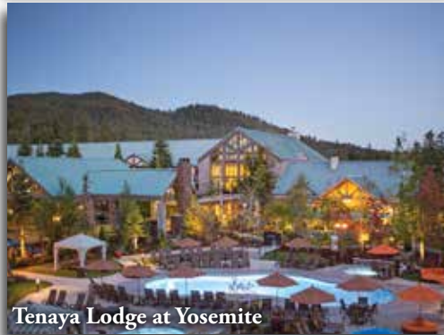
Tenaya Lodge at Yosemite